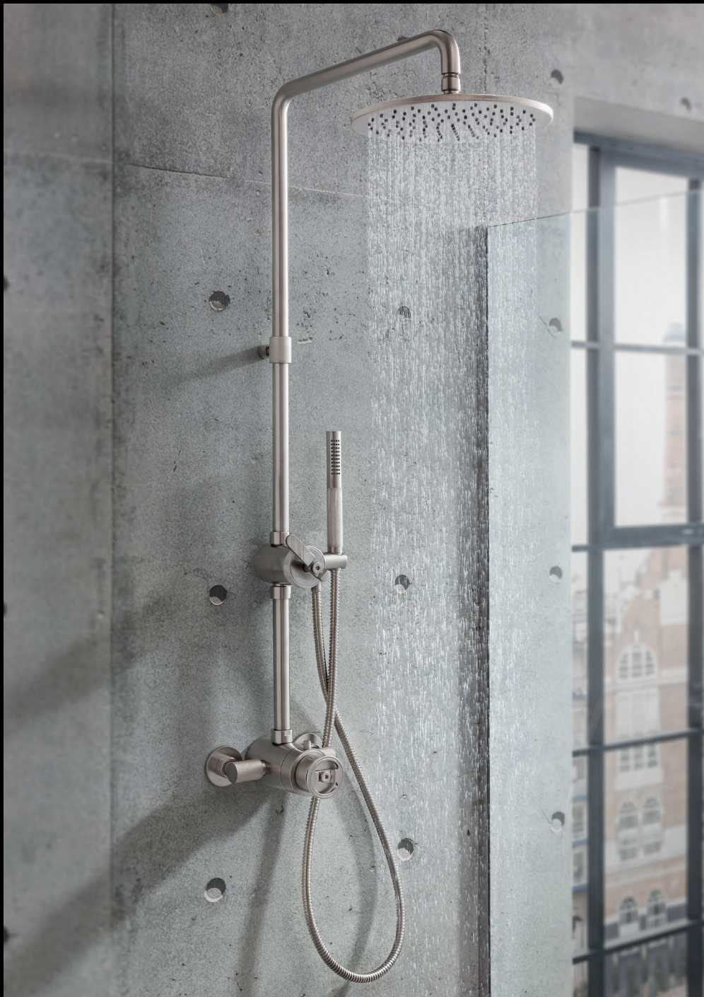
LEFT: UNION exposed thermostatic shower in Brushed Nickel