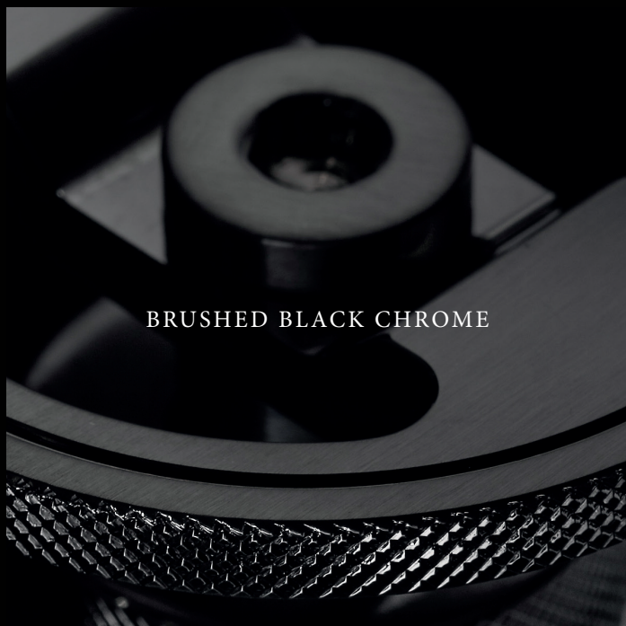
BRUSHED BLACK CHROME