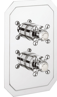
3 function, non-shared